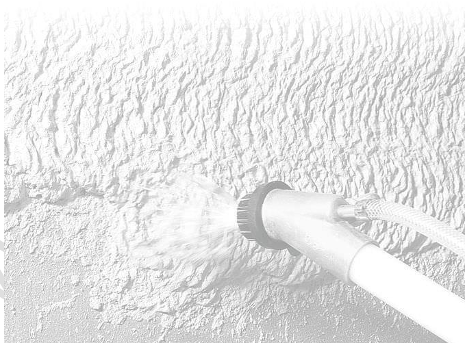
(Table 9) physical properties of proposed Mix designs