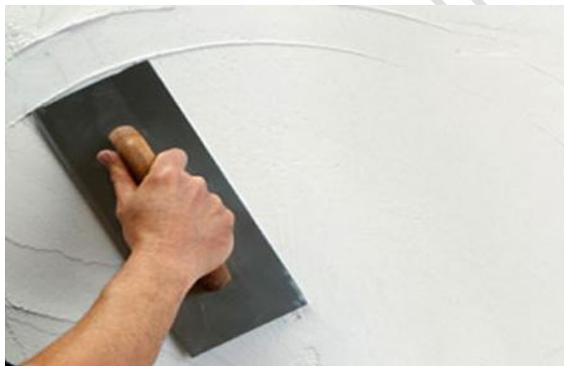
(Table 11) physical properties of proposed Mix designs